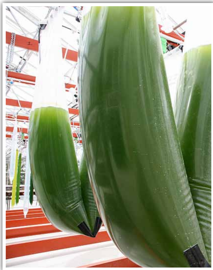
Synthetic algae growing in a greenhouse.

Strict standards that prohibit conflicts of interest should be maintained in the oversight of synthetic biology research, including but not limited to prohibiting persons with financial interests in synthetic biology research, development and commercialization from roles in its health and safety oversight.