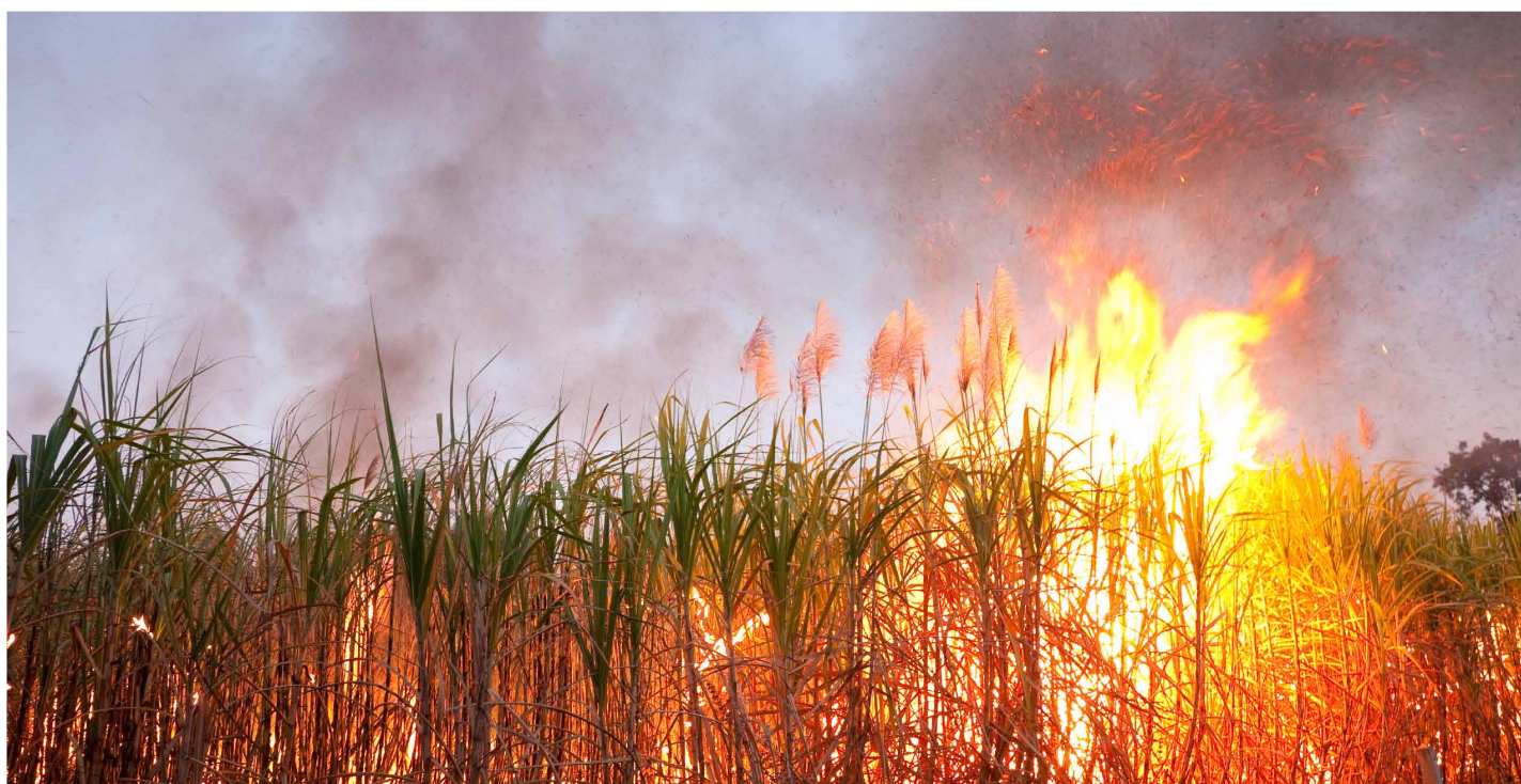
Synthetic biology products depend upon fermenting large quantities of sugarcane. The production and harvesting, including burning, of cane fields releases large amounts of carbon dioxide and causes other environmental and social harms.

Until the above principles are incorporated into international, federal and local law as well as research and industry practices, there must be a moratorium on the release and commercial use of synthetic organisms.